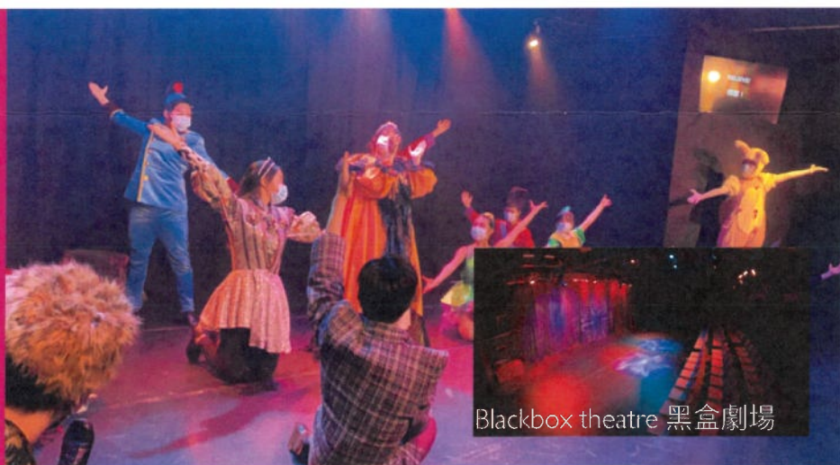
Blackbox theatre 黑盒劇場