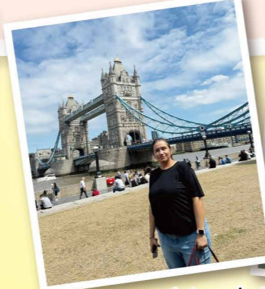
A tour in London