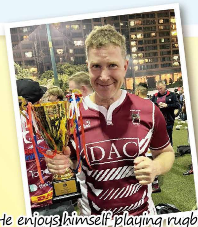
He enjoys himself playing rugby too. Hurray! Just won a tournament.