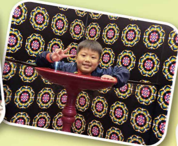
Students looked in the mirrors in the World of Mirrors. They saw different reflections from the other mirrors. They had lots of fun.