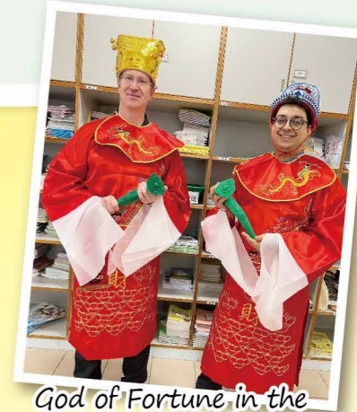
God of Fortune in the Chinese Carnival. They were so cute!