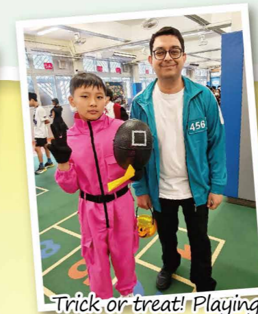
Trick or treat! Playing Halloween games with students.